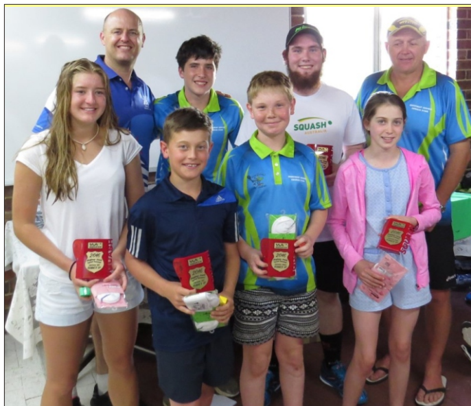
Manjimup Runners Up: All Divisions