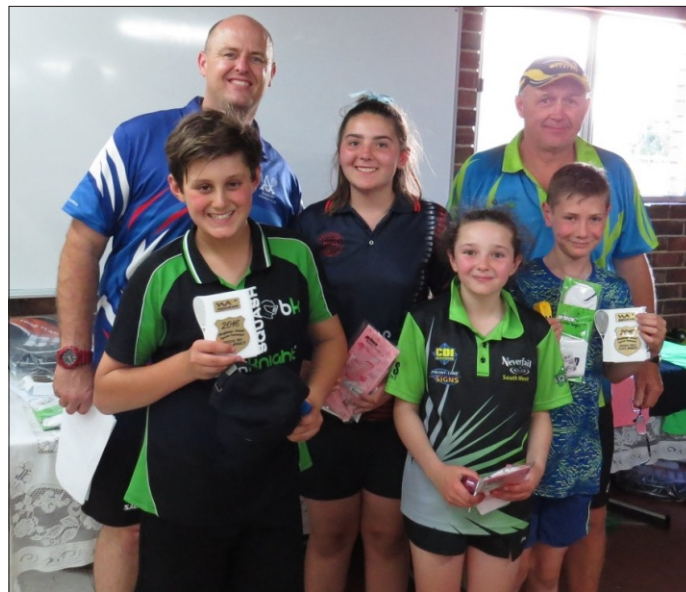
Manjimup Plate Winners All Divisions

A special thank you to all the players, parents, volunteers and fantastic sponsors who have supported the South West Grand Prix and each of the individual events.