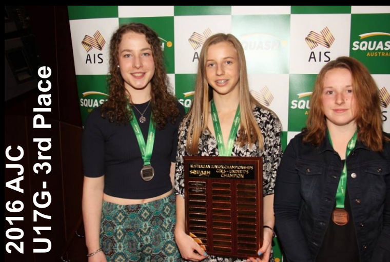
2016 AJC U17G- 3rd Place