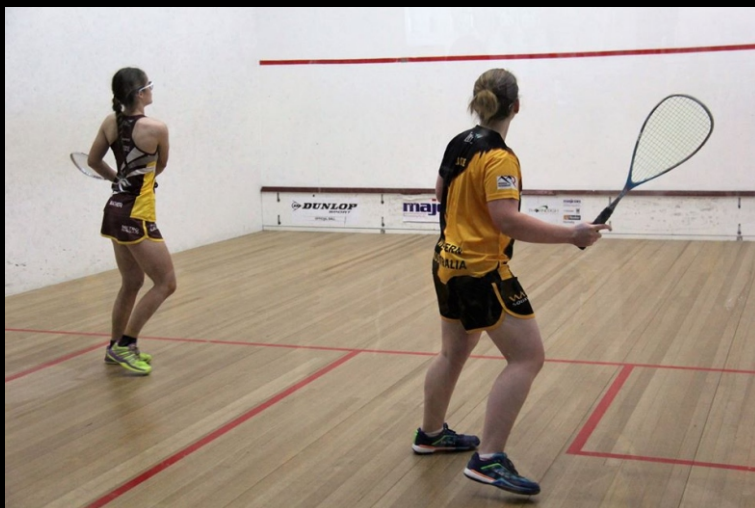
2016 AJC Teams v Queensland