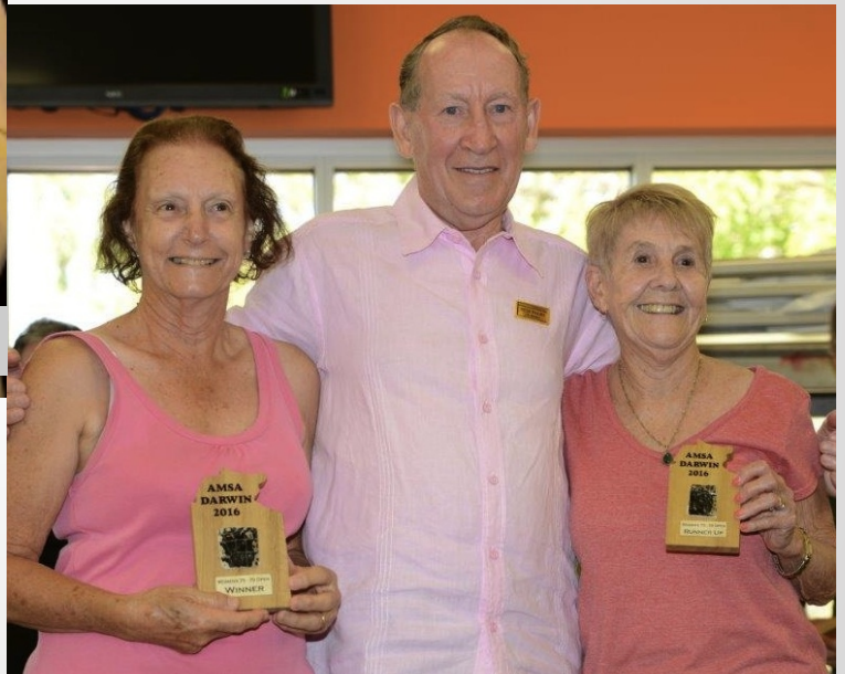
2016 AMSA W75-79 Runner Up