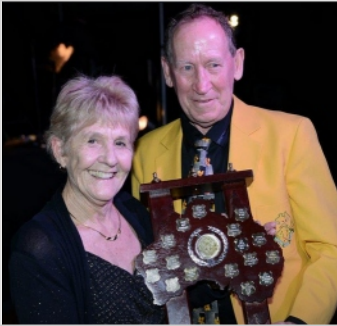
2015 AMSA Judith Goadby Award

current “raffle girl”. She regularly plays Masters’ tournaments and is the current Masters’ State Champion for her age group.