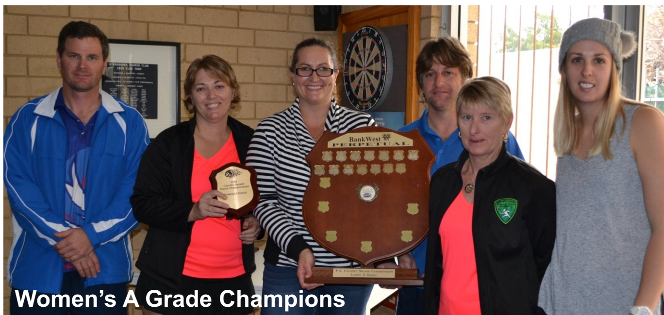
Women's A Grade Champions