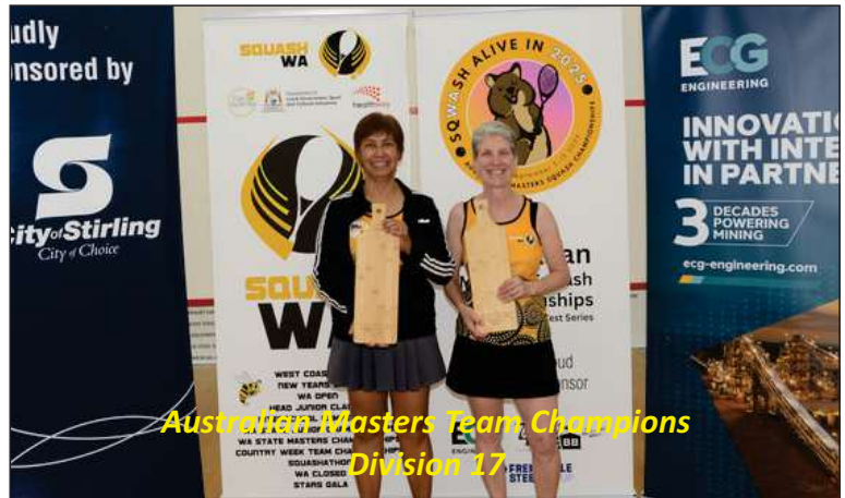
Australian Masters Team Champions Division 17