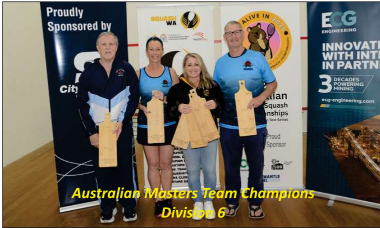
Australian Masters Team Champions Division 6