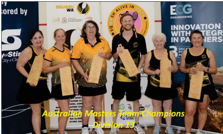
Australian Masters Team Champions Division 13