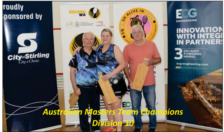
Australian Masters Team Champions Division 10