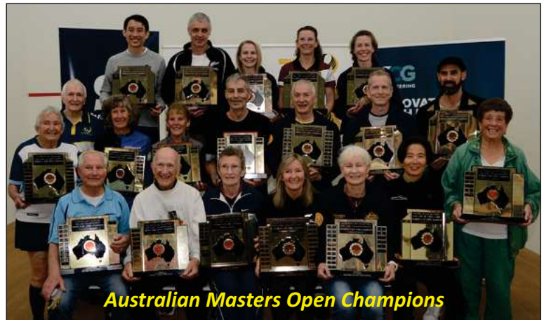
Australian Masters Open Champions