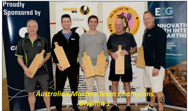
Australian Masters Team Champions Division 1