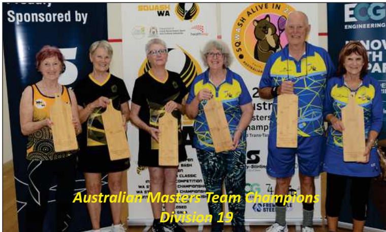
Australian Masters Team Champions Division 19