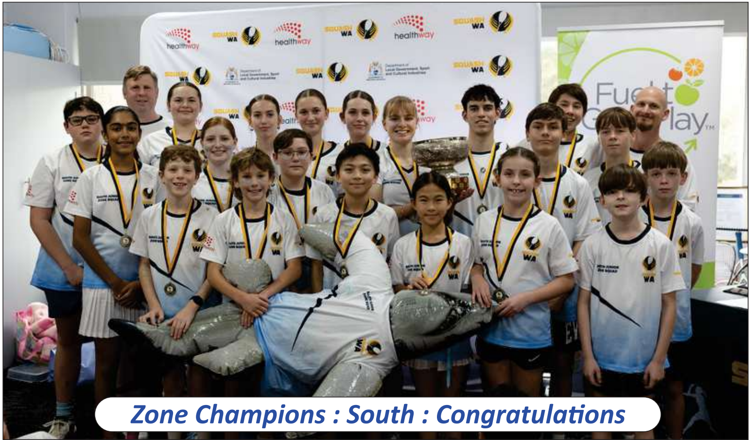
Zone Champions : South : Congratulations