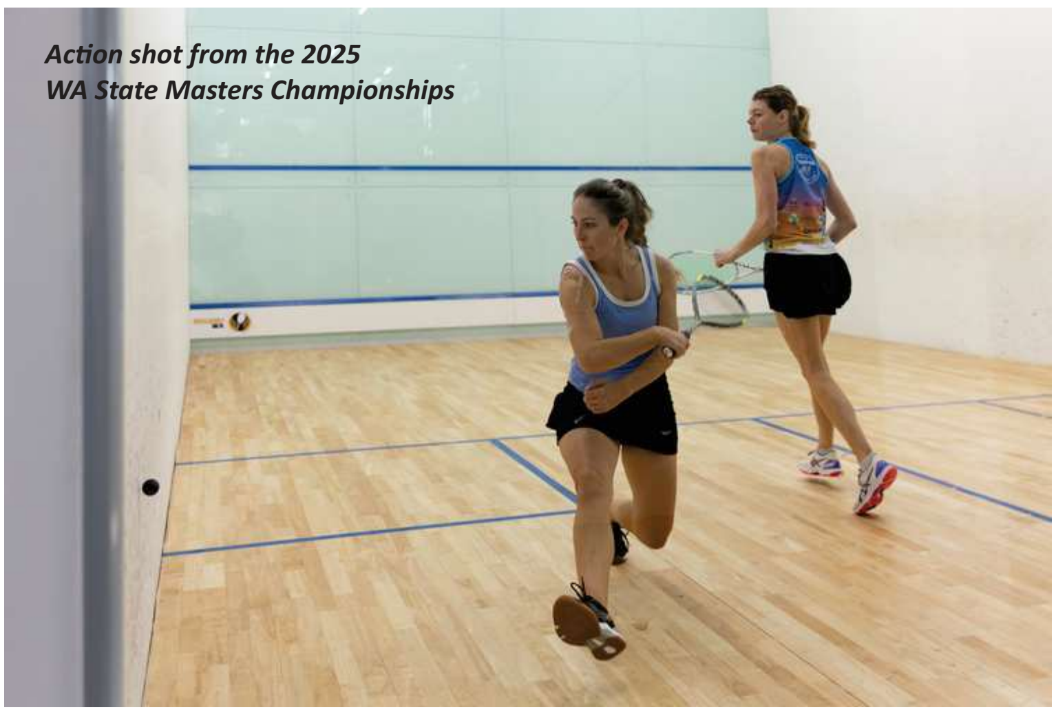
Action shot from the 2025 WA State Masters Championships