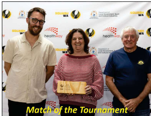
Match of the Tournament