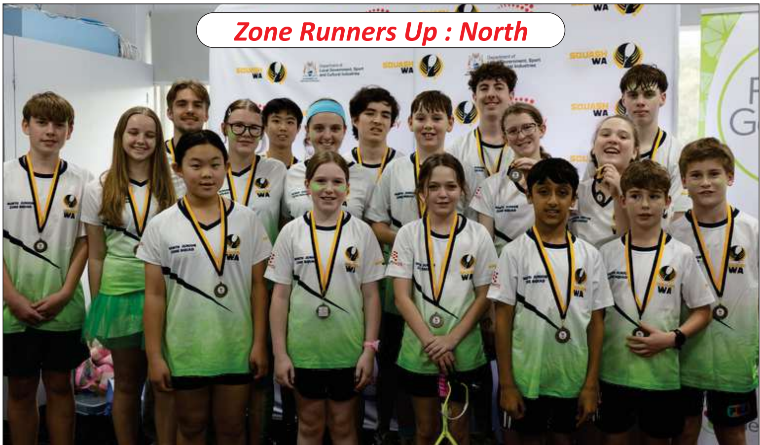
Zone Runners Up : North