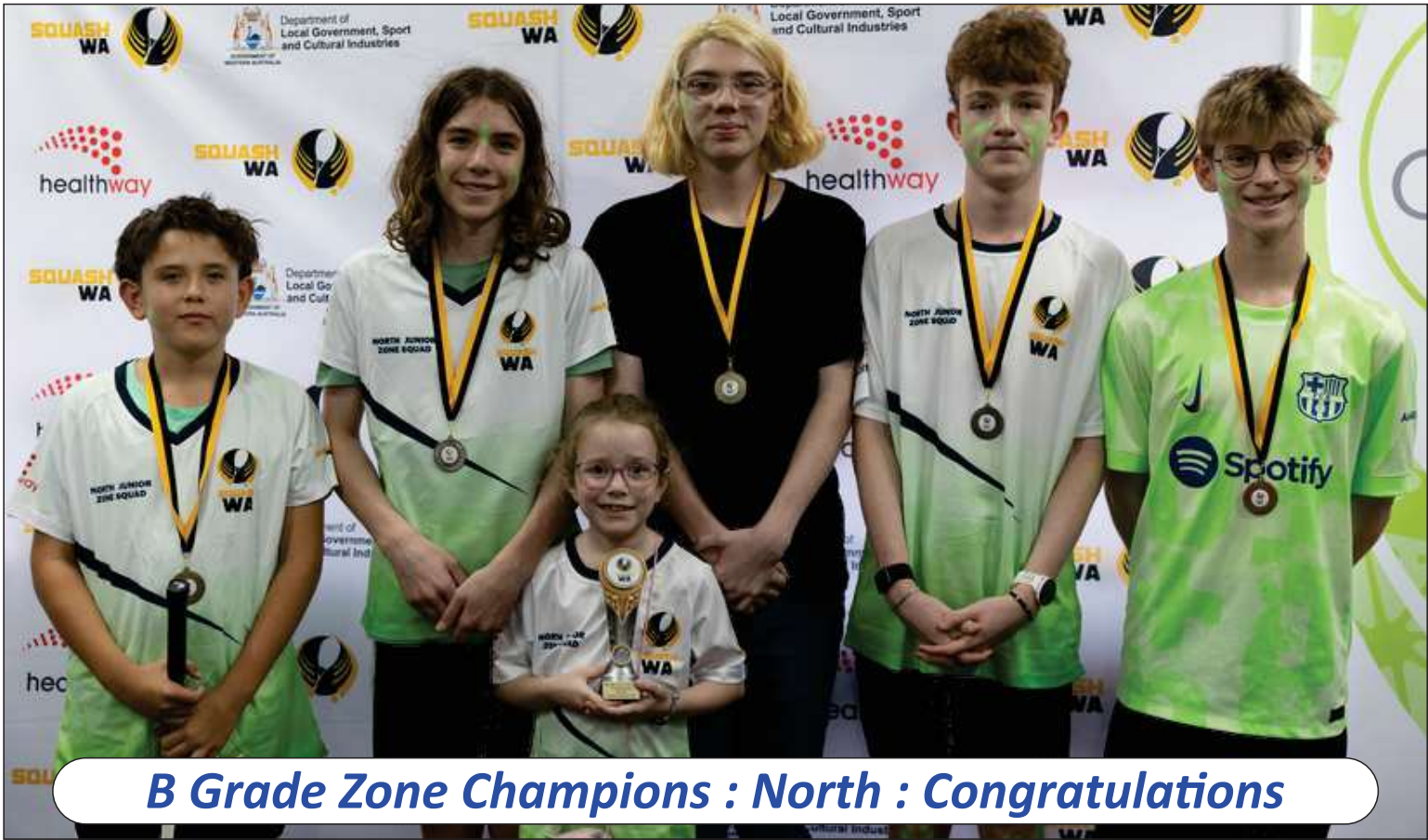
B Grade Zone Champions : North : Congratulations