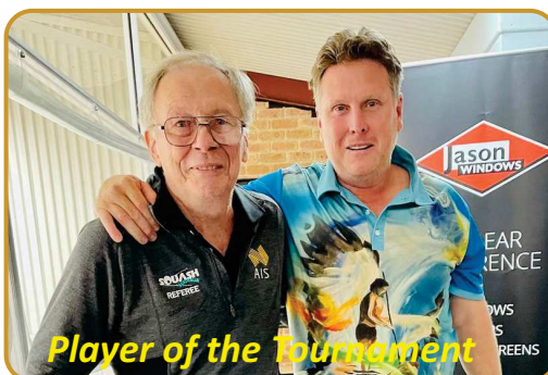
Player of the Tournament