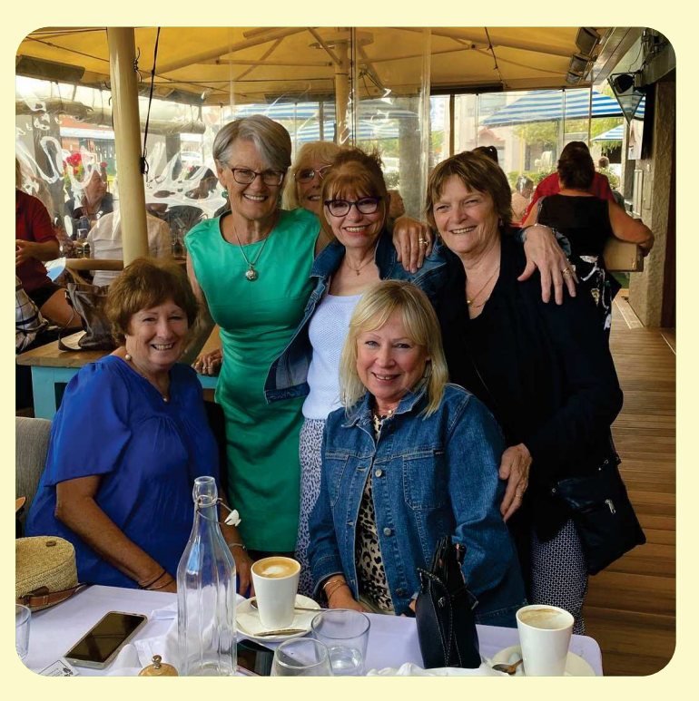
Photo: The girls letting their hair down at the end-of-year gathering at the Inglewood.