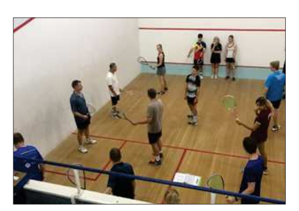
Participants using their non dominant hand

The Foundation participants departed at lunch time. Club Development went on to discuss PDA (participation, decision and action) and court movement.