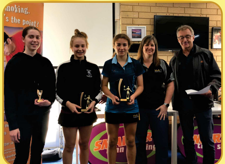
Under 17 Presentations