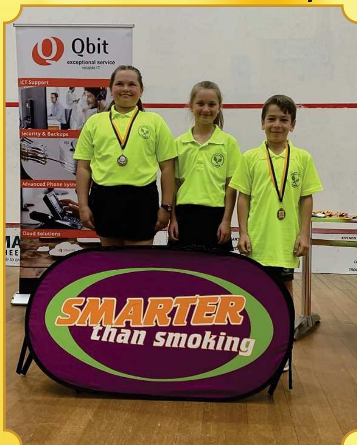
Under 11 Team Champs