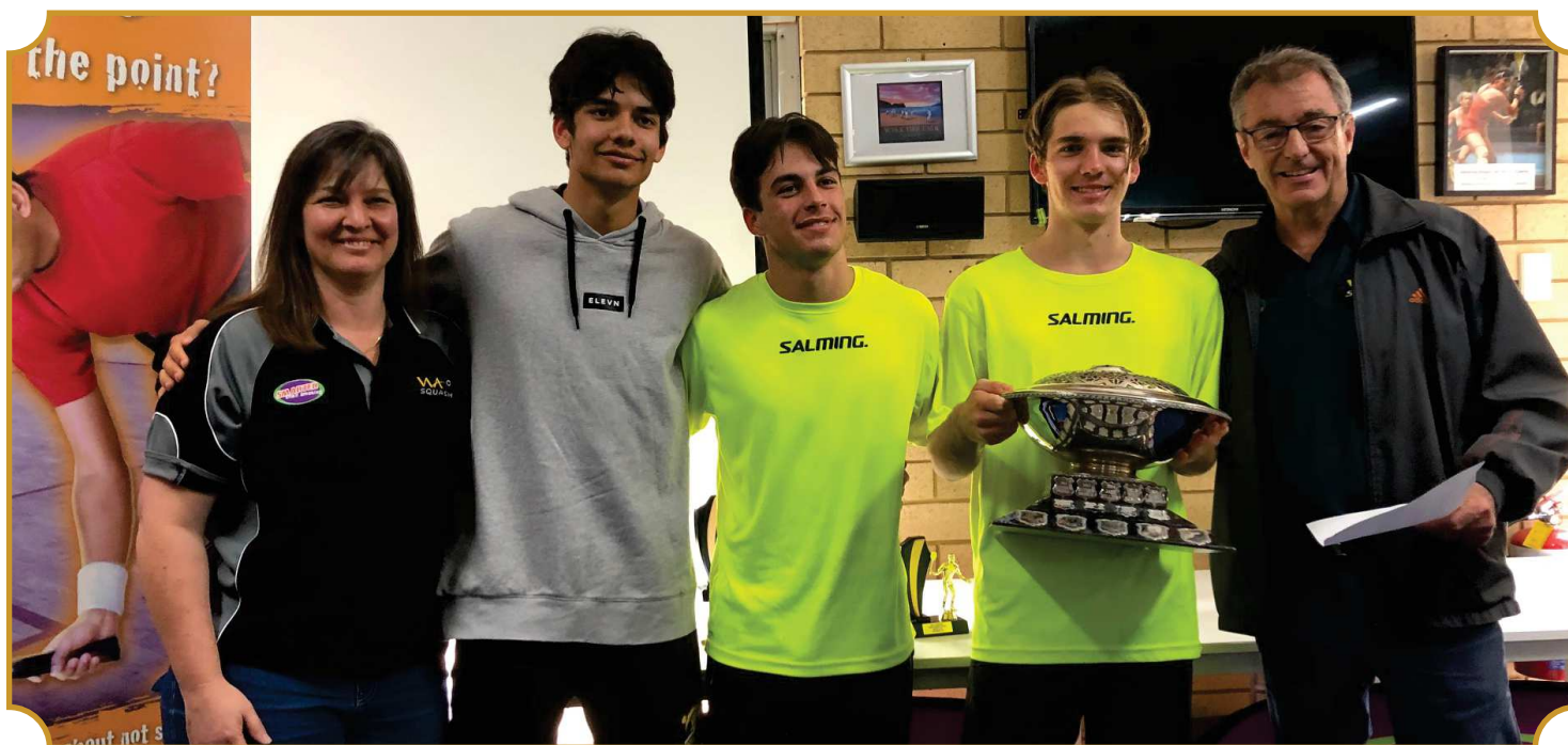
Under 19 Boys Presentation

In conclusion it was fantastic to see the WA Open, the WA Closed, the State Junior Titles and the State Junior Teams played after all the uncertainty in 2020.