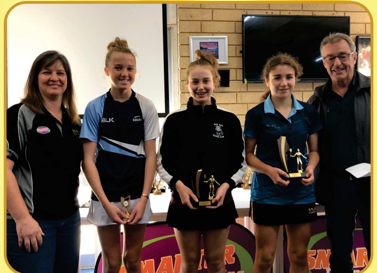
Under 15 Presentations