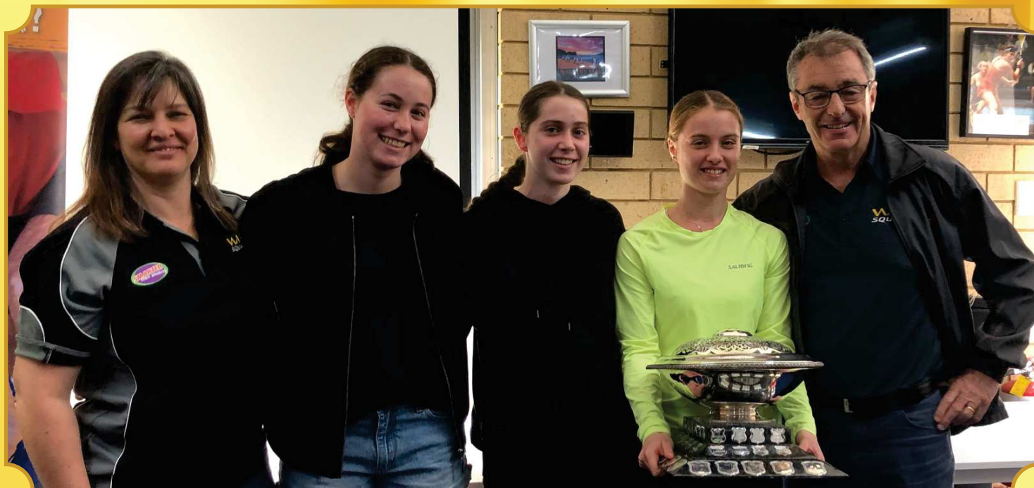
Under 19 Girls Presentation