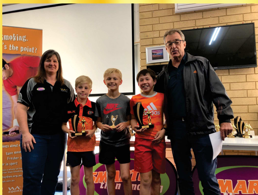
The mighty under 11s !!!