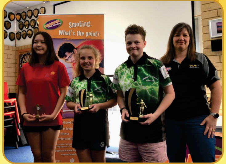
Under 13 Presentations