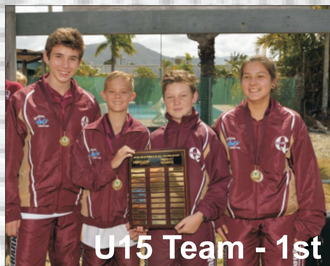
U15 Team - 1st