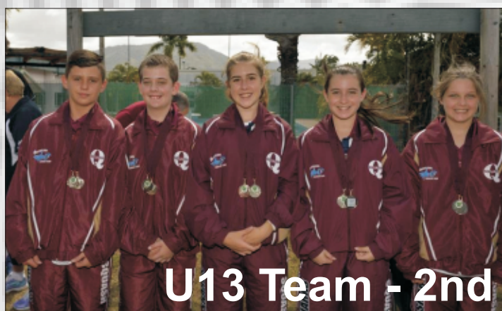
U13 Team - 2nd