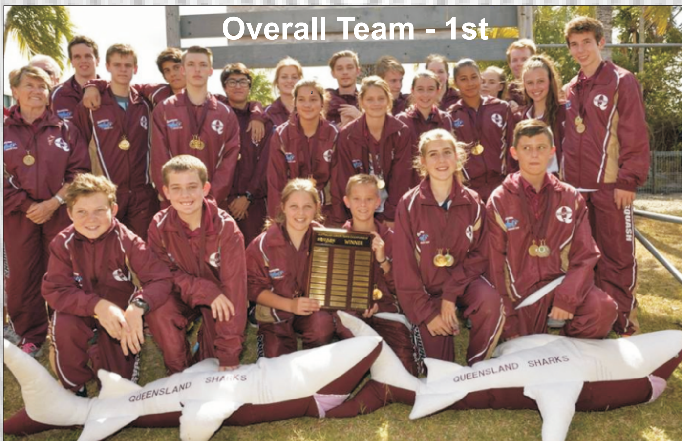
Overall Team - 1st