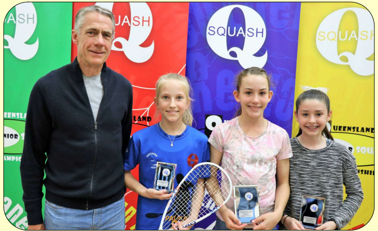
2016 U13 Presentations