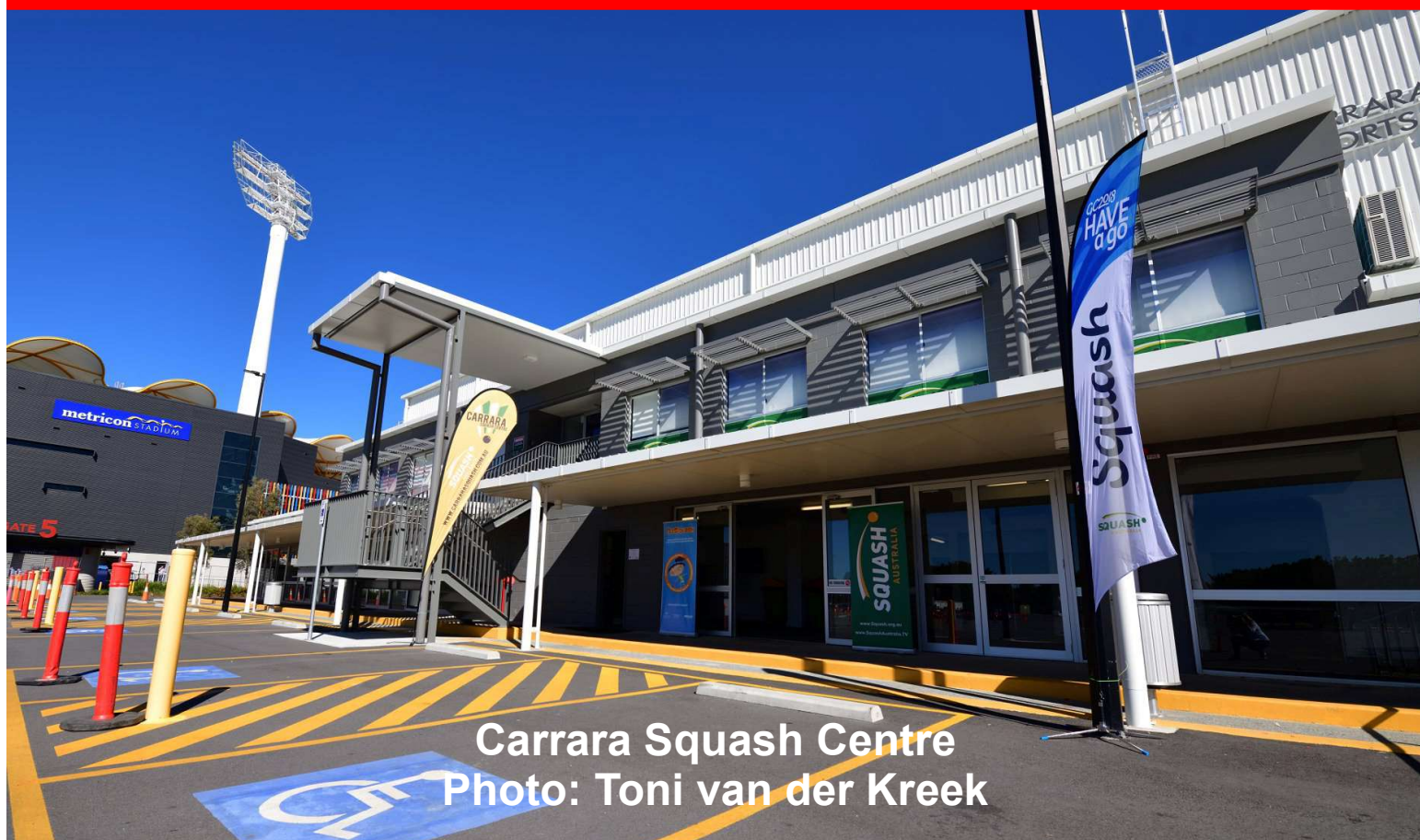
Carrara Squash Centre