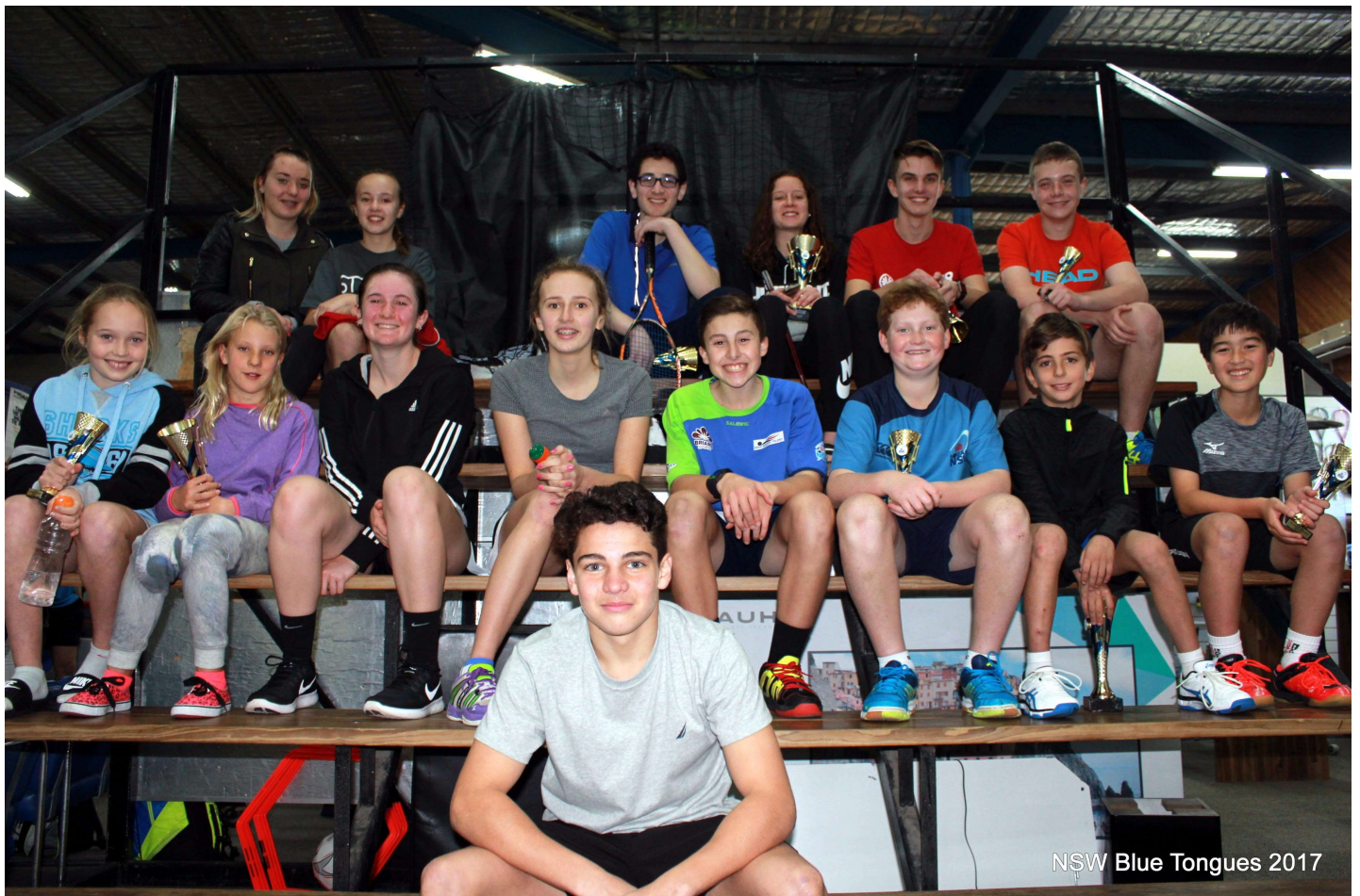
NSW Blue Tongues 2017