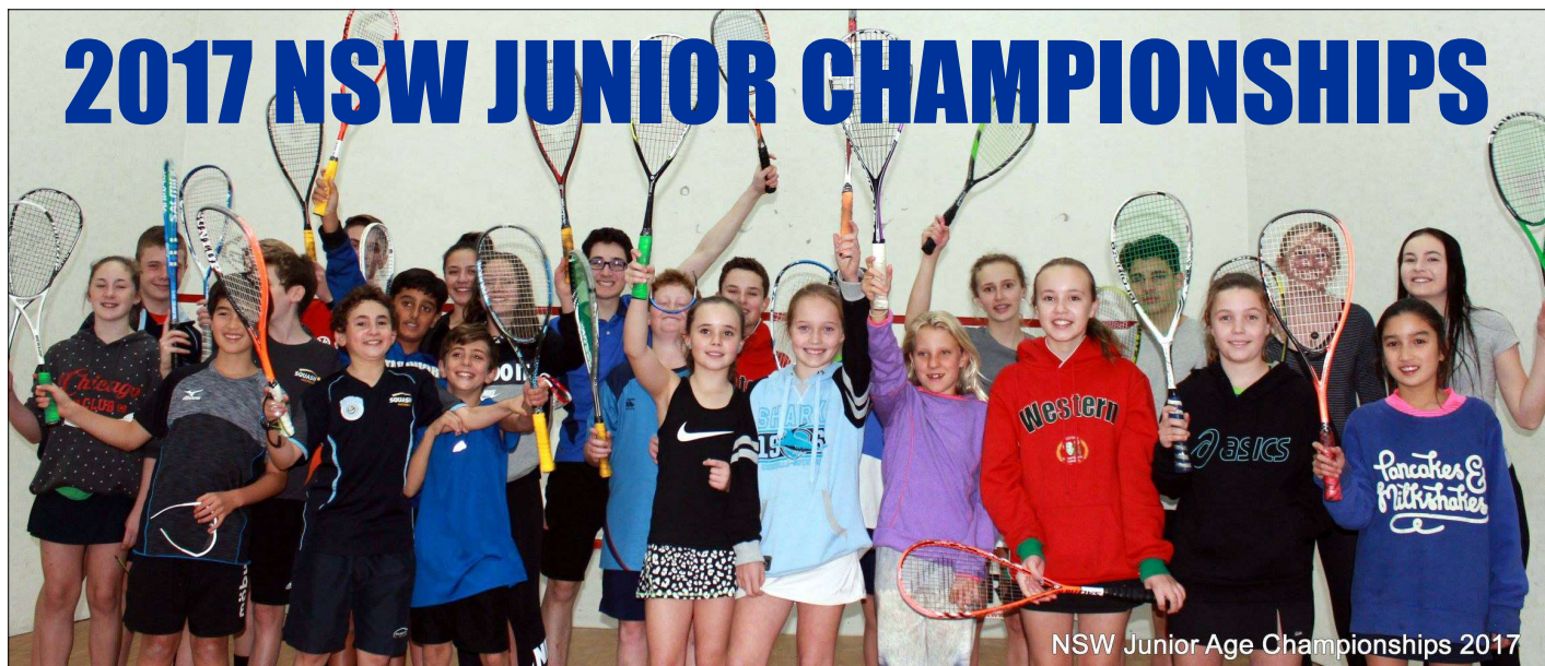
NSW Junior Age Championships 2017